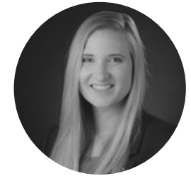
CHRISTIE COX NASA