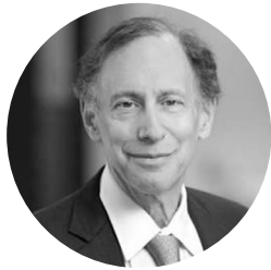
ROBERT LANGER MIT USA